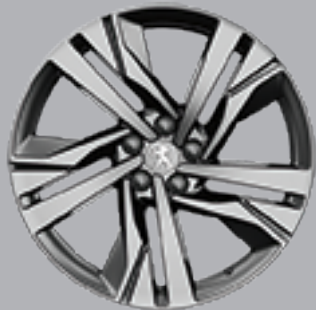
19" 'AUGUSTA' diamond-cut two tone Genuine accessory