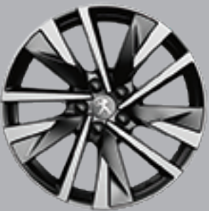
18" 'Sperone' Diamond-cut two tone