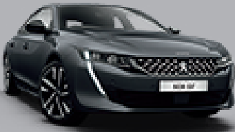
Hurricane Grey (1)